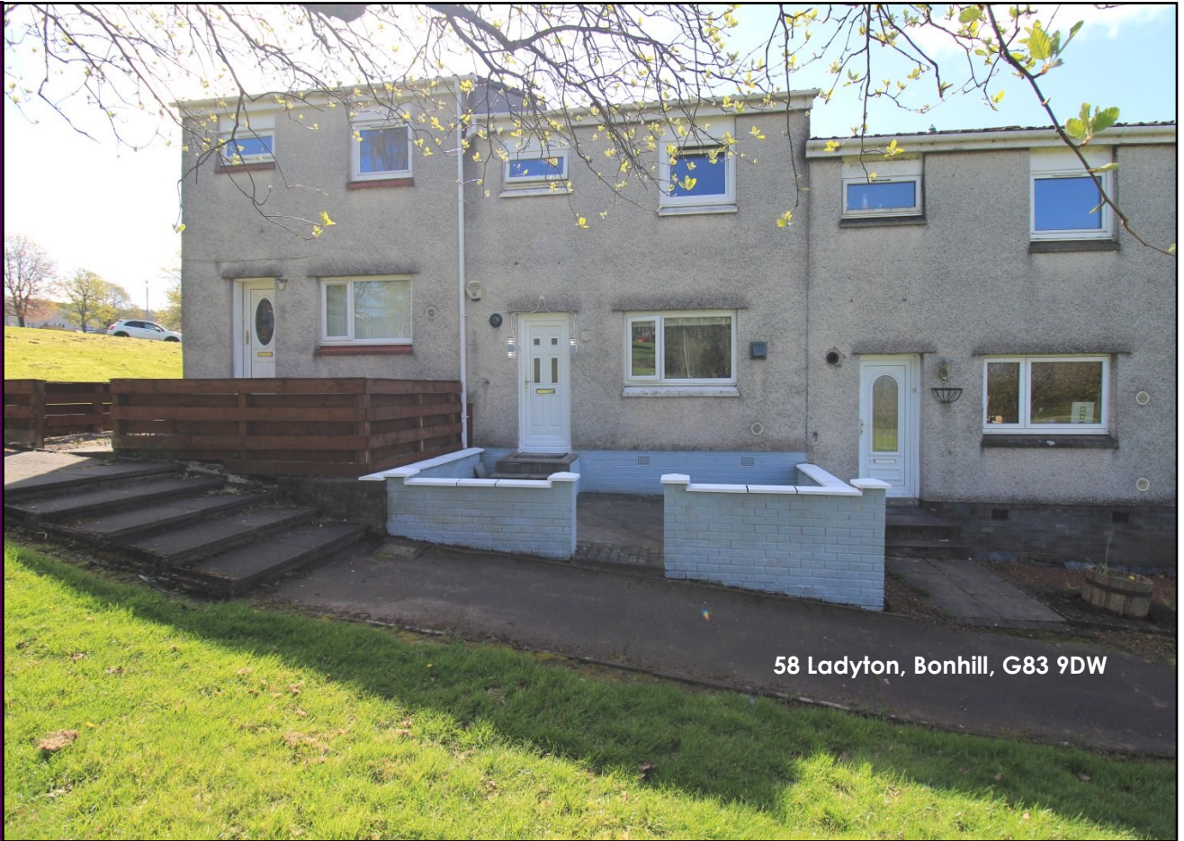
58 Ladyton, Bonhill, G83 9DW

This spacious and well-presented three-bedroom mid-terrace villa is located in the popular Ladyton Estate and is close to a wide range of shops, schooling and public transport links making this an ideal family home.